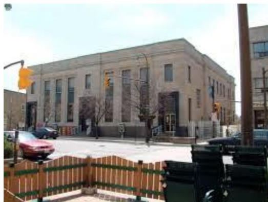
Figure 2: Post Office Building in Guelph

Bruce, Andrew. "Downtown Post Office the Favoured Site for New Library; Committee Will Seek the Support of Guelph Library Board Tuesday." Guelph Mercury . 14 June 2003: A5. ProQuest. Web. 18 November 2015.