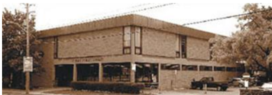
Figure 4: Guelph Public Library Main Library

Guelph Public Library Board. Guelph Public Library Board Minutes. 14 March 2006. Guelph: Guelph Public Library. Print.