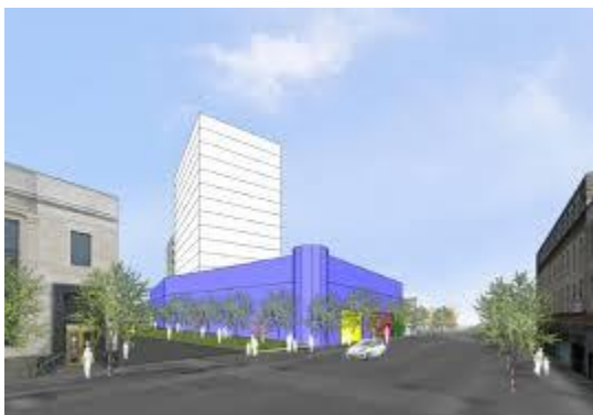
Figure 5: View of New Central Library from Wyndham Street

Guelph Public Library Board. Guelph Public Library Board Minutes . 21 February 2012. Guelph: Guelph Public Library. Print.