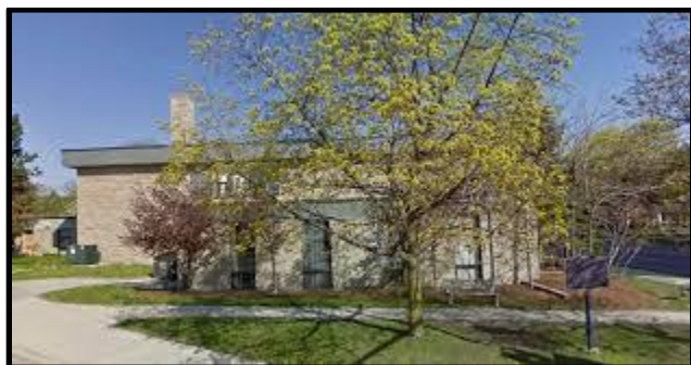
Figure 1: A photograph of the Guelph Public Library's Main Library in Early Spring